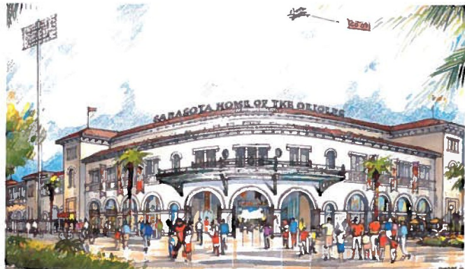
Renovated Ed Smith Stadium for the Baltimore Orioles.

Total of Annual Increased Personal Earnings, Savings, and Economic Impacts: $86,271,280